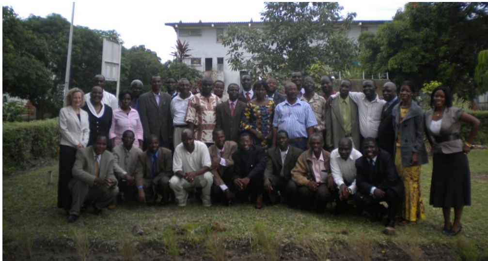
Some of the students in training in Lusaka, Zambia - March 2010

The training also presents recommended strategies for helping children overcome the emotional impact of parental loss.